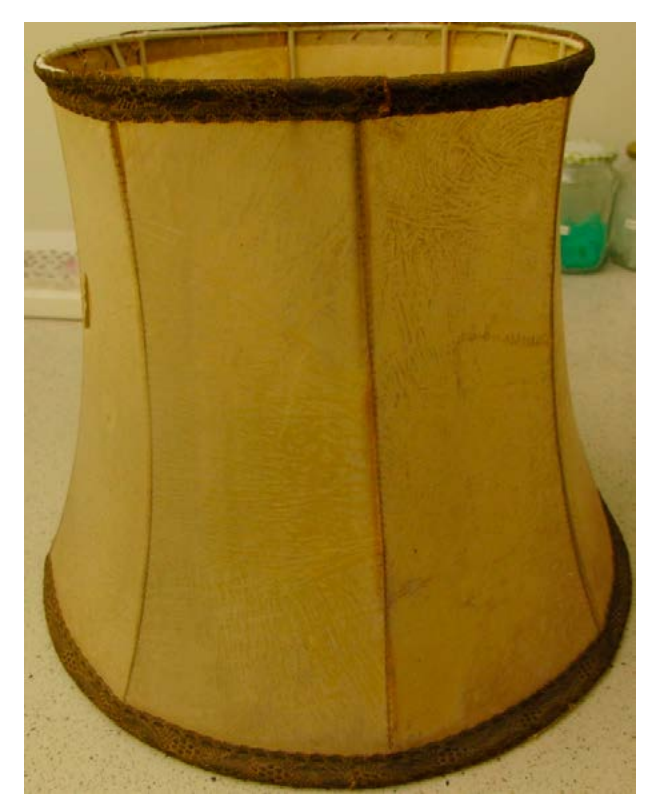
Figure 4. The lampshade examined in this paper

3.2 Methods. The DNA for examination was isolated from three pieces of about 0.5 \text{ cm}^2 cut from three different panels using the QIAamp DNA Mini Kit (Qiagen) according to the manufacturer's protocol for tissues. Before extraction of genetic material, the lampshade sections were rinsed twice in 1 ml of molecular biology water and dried for 10 minutes under UV light. The quantitative and qualitative