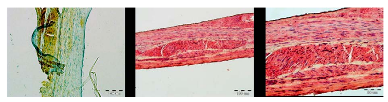
Figure 5. Histological examination of lampshade fragments. The resulting histological image is characteristic for the intestine and not mammalian skin. Photo on the left: unstained tissue specimen; middle photo and photo on the right: two tissue sections from different parts of the lampshade, classical HE (hematoxylin-eosin) staining.

The histological consultation proved that the material used to make the lampshade was not skin but mammalian (non-human) intestine because human intestines are too small to fashion such large flaps. The material was subjected to a multiplex test for species identification. The multiplex test included primers of three big animals (cattle, equines, and deer) and two smaller ones (sheep and wild boar). The sample tested positive for cattle (Fig. 6).