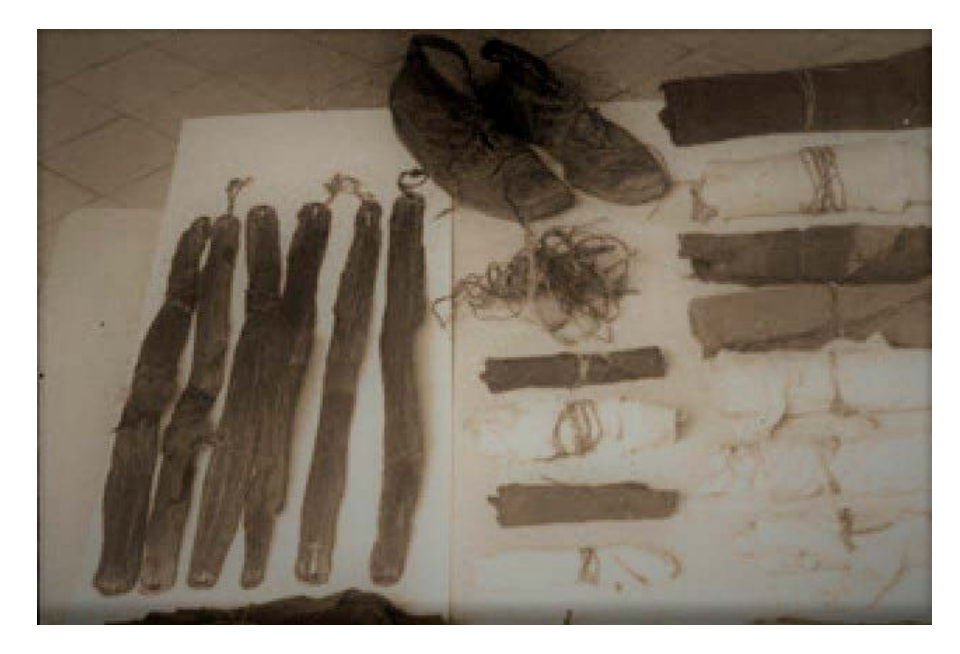
Figure 2. Human-skin items made by Karl Denke, secured by the police

sic literature. The authors may recall the practice of a notorious serial killer Karl Denke (1860-1924) from Ziębice, who made belts and suspenders from the skin of his victims (Fig. 2) [6,7]. His activity was commercial because Denke sold human flesh as veal along with small "leather" objects made of human skin, as it turned out later.