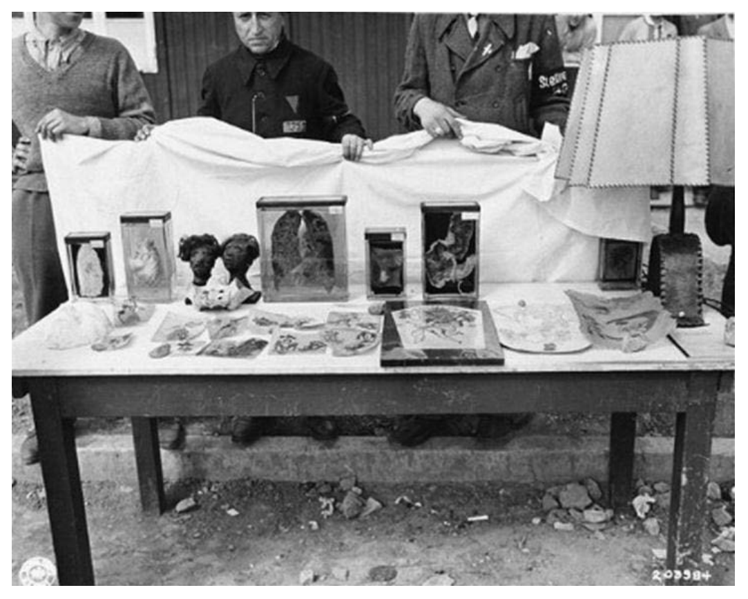
Figure 3. The photo shows evidence of Nazi crimes, presented after liberating KL Buchenwald. It shows museum preparation for the study of anatomy, treated skin flaps with tattoos, shrunken human heads, and on the right, a lampshade believed to be made from human skin

Looking for the roots of the belief that the lampshades of the first type might have been made from human skin, the authors found an interesting archival photo online in Der SPIEGEL magazine, issue of February 23, 2018. It is presented in Figure 3.