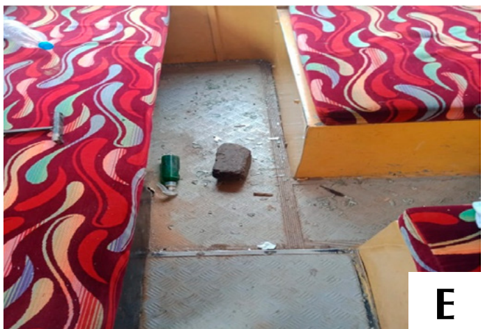
Figure 1. (A) Abraded contusion of the left side of chest. (B) The heart showing laceration of the base of the left ventricle with surrounding contused myocardium. (C) Cardiac contusion of the right ventricle and right atrium. (D) Haemorrhage in epicardial fat and adjacent myocardium. (E) Alleged weapon of offence i.e. brick, inside the tourist bus.